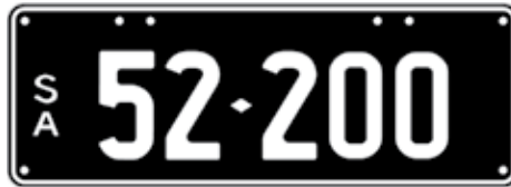
Lot 8 - SA Numeric Number Plate 52 200 Plate Size: 371 x 134mm Price sold $ _____