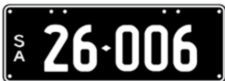
Lot 27 - SA Numeric Number Plate 26006 Plate Size: 371 x 134mm Price sold $ _____