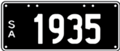
Lot 35 - SA Numeric Number Plate 1935 Plate Size: 315 x 134mm Price sold $ _____