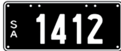
Lot 36 - SA Numeric Number Plate 1412 Plate Size: 315 x 134mm Price sold $ _____