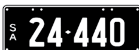
Lot 28 - SA Numeric Number Plate 24 440 Plate Size: 371 x 134mm Price sold $ _____