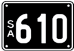
Lot 15 - SA Numeric Number Plate 610 Plate Size: 190 x 134mm Price sold $ _____