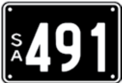
Lot 37 - SA Numeric Number Plate 491 Plate Size: 190 x 134mm Price sold $ _____