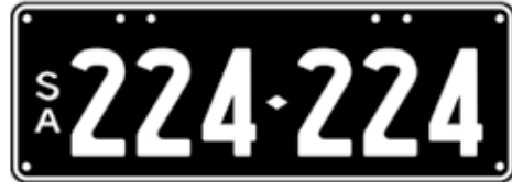
Lot 32 - SA Numeric Number Plate 224 224 Plate Size: 371 x 134mm Price sold $ _____