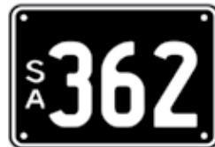
Lot 40 - SA Numeric Number Plate 362 Plate Size: 190 x 134mm Price sold $ _____