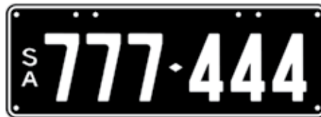
Lot 22 - SA Numeric Number Plate 777 444 Plate Size: 371 x 134mm Price sold $ _____