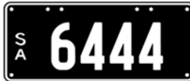
Lot 12 - SA Numeric Number Plate 6444 Plate Size: 315 x 134mm Price sold $ _____