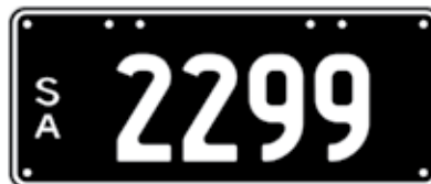
Lot 26 - SA Numeric Number Plate 2299 Plate Size: 315 x 134mm Price sold $ _____