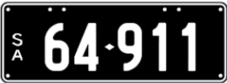
Lot 7 - SA Numeric Number Plate 64 911 Plate Size: 371 x 134mm Price sold $ _____