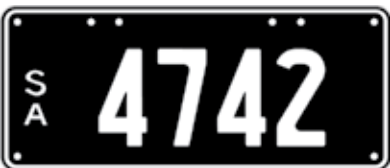
Lot 13 - SA Numeric Number Plate 4742 Plate Size: 315 x 134mm Price sold $ _____