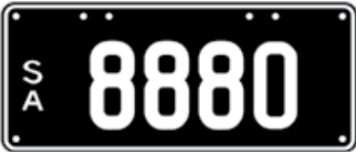
Lot 5 - SA Numeric Number Plate 8880 Plate Size: 315 x 134mm Price sold $ _____