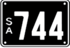
Lot 3 - SA Numeric Number Plate 744 Plate Size: 190 x 134mm Price sold $ _____