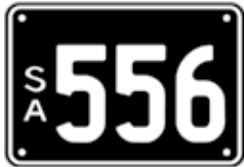
Lot 17 - SA Numeric Number Plate 556 Plate Size: 190 x 134mm Price sold $ _____