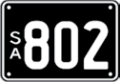
Lot 1 - SA Numeric Number Plate 802 Plate Size: 190 x 134mm Price sold $ _____