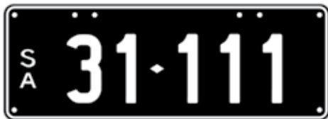
Lot 19 - SA Numeric Number Plate 31 111 Plate Size: 371 x 134mm Price sold $ _____