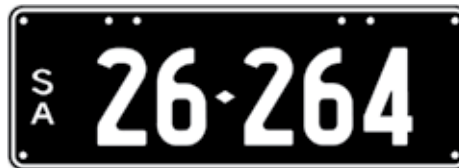
Lot 20 - SA Numeric Number Plate 26 264 Plate Size: 371 x 134mm Price sold $ _____