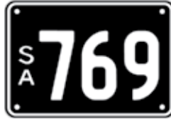
Lot 2 - SA Numeric Number Plate 769 Plate Size: 190 x 134mm Price sold $ _____