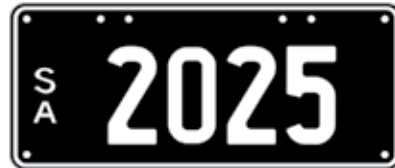
Lot 34 - SA Numeric Number Plate 2025 Plate Size: 315 x 134mm Price sold $ _____