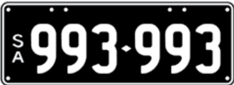
Lot 9 - SA Numeric Number Plate 993 993 Plate Size: 371 x 134mm Price sold $ _____