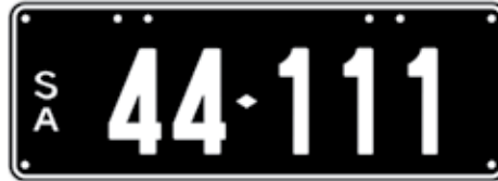
Lot 18 - SA Numeric Number Plate 44 111 Plate Size: 371 x 134mm Price sold $ _____