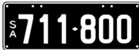
Lot 24 - SA Numeric Number Plate 711 800 Plate Size: 371 x 134mm Price sold $ _____