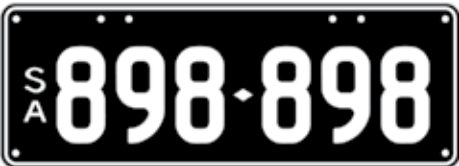
Lot 11 - SA Numeric Number Plate 898 898 Plate Size: 371 x 134mm Price sold $ _____