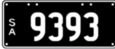
Lot 4 - SA Numeric Number Plate 9393 Plate Size: 315 x 134mm Price sold $ _____