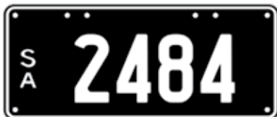
Lot 25 - SA Numeric Number Plate 2484 Plate Size: 315 x 134mm Price sold $ _____