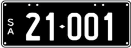
Lot 29 - SA Numeric Number Plate 21 001 Plate Size: 371 x 134mm Price sold $ _____