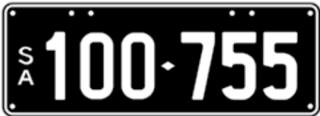
Lot 33 - SA Numeric Number Plate 100 755 Plate Size: 371 x 134mm Price sold $ _____