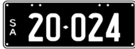
Lot 30 - SA Numeric Number Plate 20 024 Plate Size: 371 x 134mm Price sold $ _____