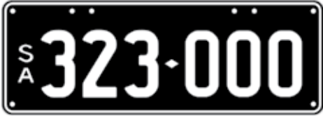
Lot 31 - SA Numeric Number Plate 323 000 Plate Size: 371 x 134mm Price sold $ _____