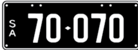
Lot 6 - SA Numeric Number Plate 70 070 Plate Size: 371 x 134mm Price sold $ _____