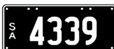
Lot 14 - SA Numeric Number Plate 4339 Plate Size: 315 x 134mm Price sold $ _____