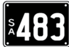
Lot 38 - SA Numeric Number Plate 483 Plate Size: 190 x 134mm Price sold $ _____