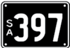
Lot 39 - SA Numeric Number Plate 397 Plate Size: 190 x 134mm Price sold $ _____