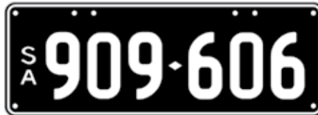
Lot 10 - SA Numeric Number Plate 909 606 Plate Size: 371 x 134mm Price sold $ _____