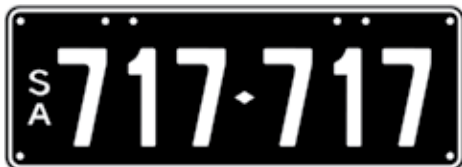
Lot 23 - SA Numeric Number Plate 717 717 Plate Size: 371 x 134mm Price sold $ _____