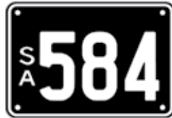
Lot 16 - SA Numeric Number Plate 584 Plate Size: 190 x 134mm Price sold $ _____